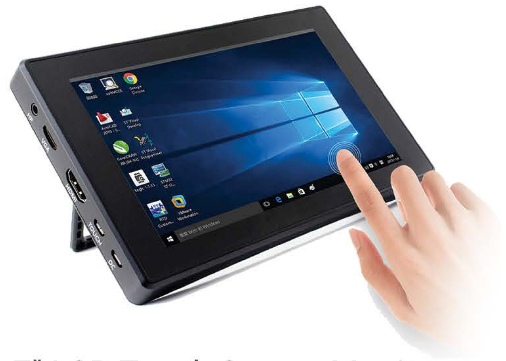
7" LCD Touch Screen Monitor