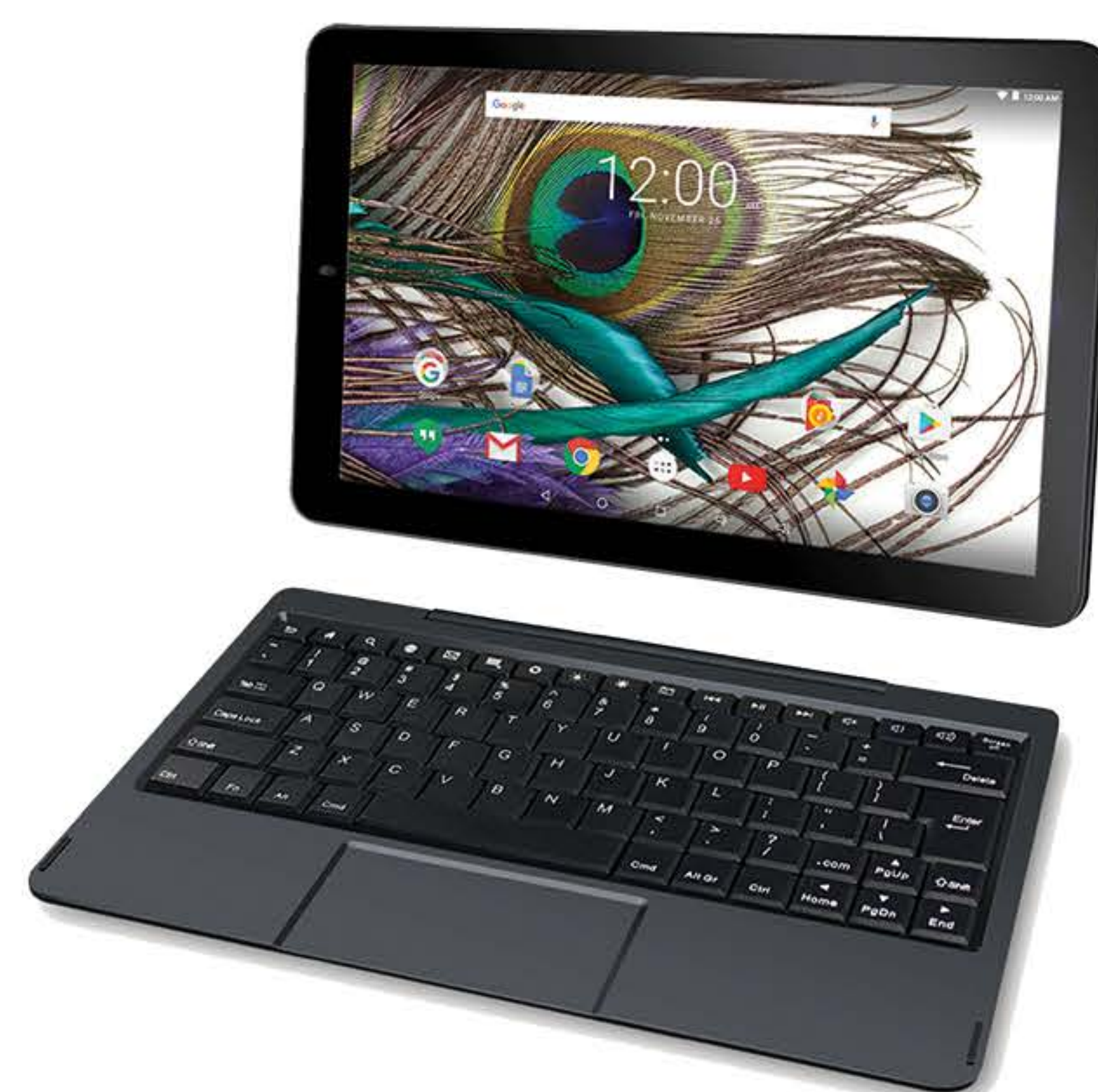
10" Tablet with Keyboard for Wireless Control