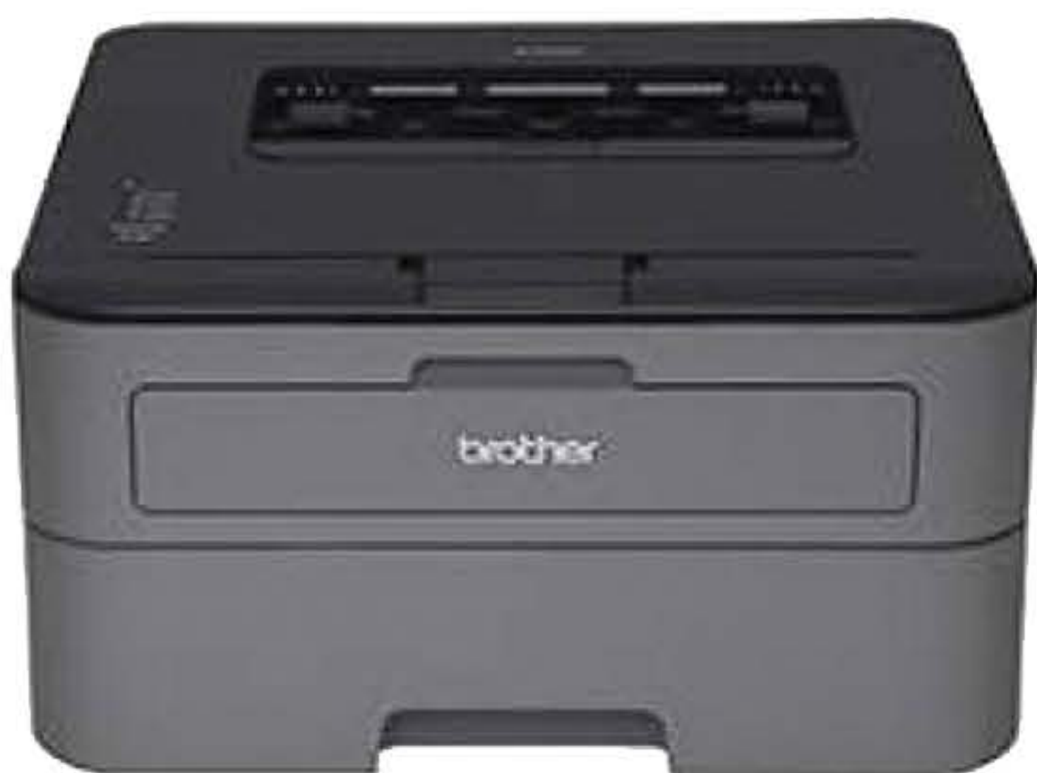
Laser Printer (labels & certificates)