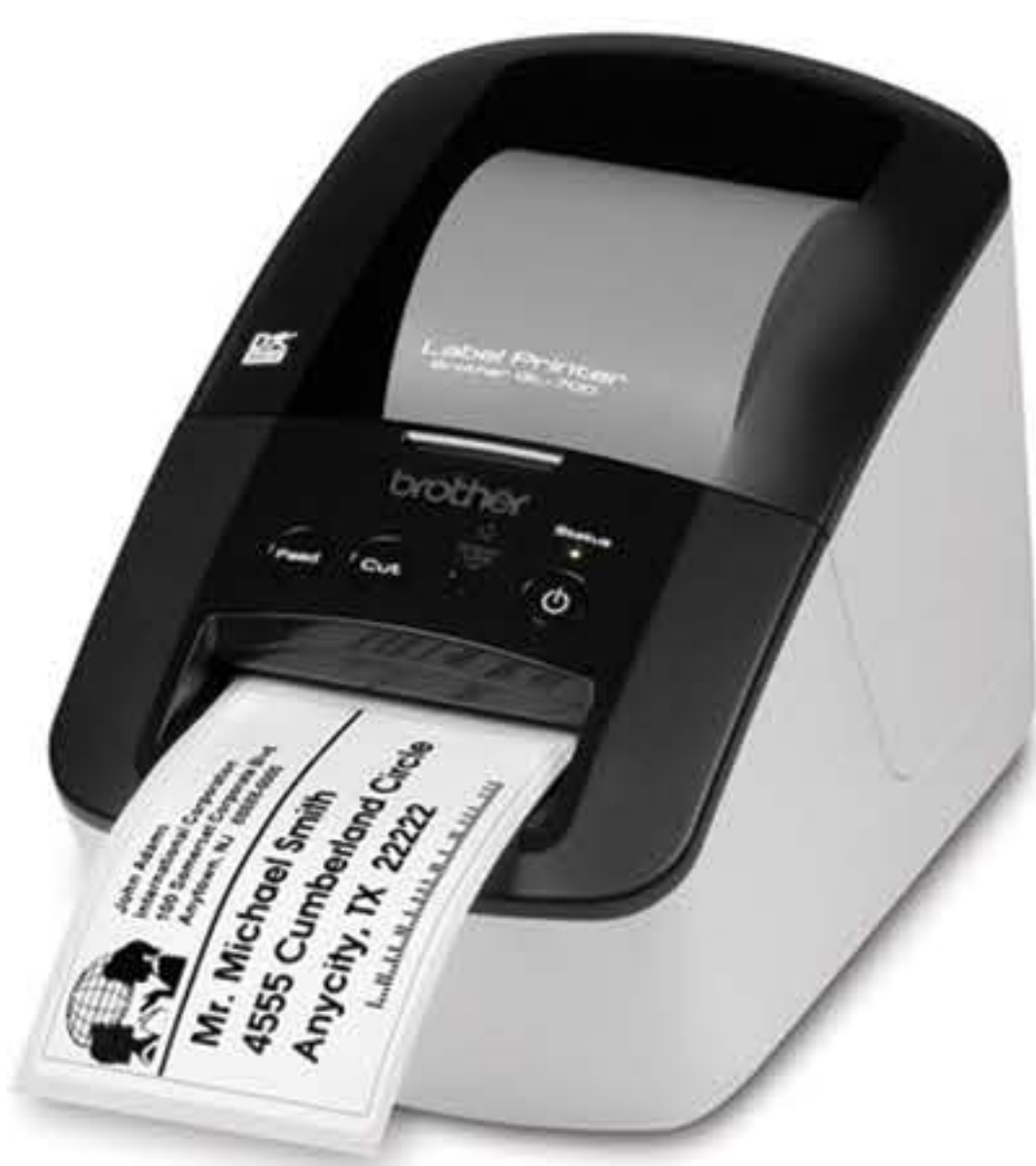
Compact Label Printer (HDD stickers)